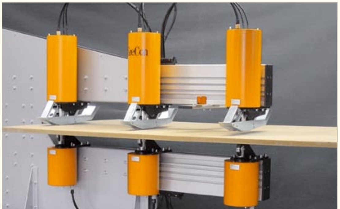
Contact measurement with ct-frame

To protect the measuring heads against mechanical damage, through blisters, for example, they are equipped with relatively big rollers. The top heads have special inclined inlet rails to avoid damage.