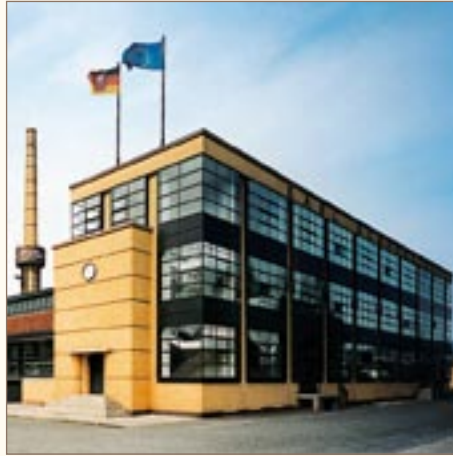
Fagus Factory, constructed by Walter Gropius in 1911

GreCon P.O.BOX 1243 D-31042 ALFELD/HANNOVER GERMANY