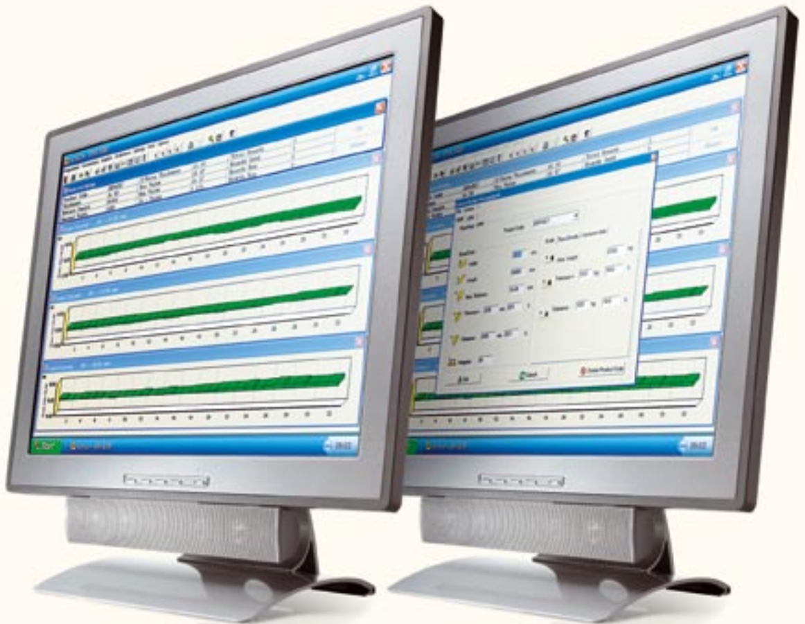
Visualisation of thickness values

GreCon measuring systems are equipped with a modem, by means of which a direct connection to the GreCon after-sales service can be made. Support, changes in parameters, software updates and trouble shooting are all possible online.