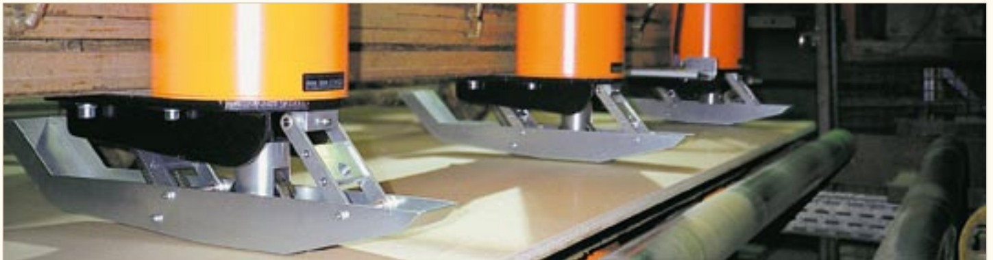
Final quality control after the sanding line

A combination of up to three thickness gauges is used for final quality control in the sanding line. For example: a 1-track thickness gauge is installed before the calibration sander, a 2-track system after the calibration sander and a 3-, 5- or 7-track system after the finishing sander. Besides quality control, the measured data can be used to adjust the sanders to the current thickness values.